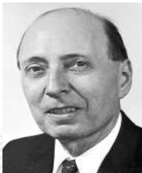
Eugene Paul Wigner

He further said, “There is strange disparity between the sciences of inert matter and those of life. Astronomy, mechanics and physics are based on concepts which can be expressed, tersely and elegantly, in mathematical language. Such is not the position of biological sciences. Those who investigate the phenomenon of life are as if lost in an extricable jungle. ... They are crushed under a mass of